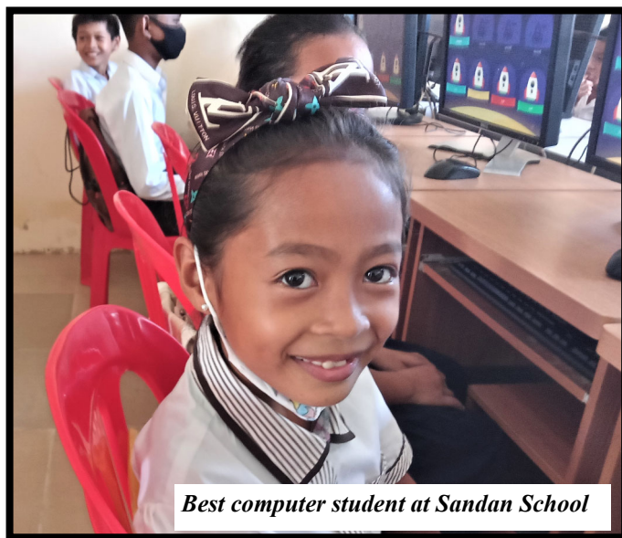
Best computer student at Sandan School

Daily English and Computer classes are in full swing at both Phum Tnal and Sandan Schools. 380 students from 3rd to 6th grade are now enrolled. The students are placed according to their ability and proficiency, rather than their age or grade level. Our teachers assessed each class at the end of the quarter and special honor was given to the top students in both schools.